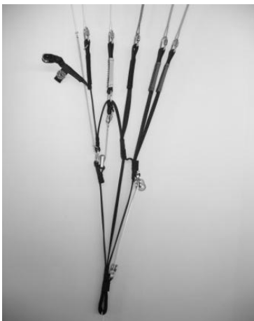
Risers MAVERICK , Size M

MAVERICK has 4 fold risers with acceleration system. Big and Small Ears are made easier by the separation of the A-risers. Simple launch behaviour, B-Stall, steering with the D-risers and an optimal geometry for accelerated flight were important aspects in the development of these risers. We use 10 mm Kevlar with PE covering for protection (Race-Risers) and Maillon Rapide oval, 3,5 cm.